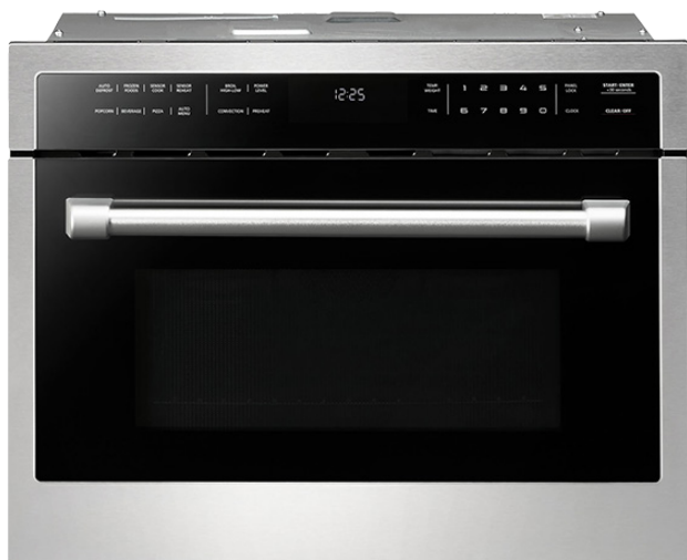
Product: 24 Inch Professional Built- In Microwave Speed Oven Model Number: TM024