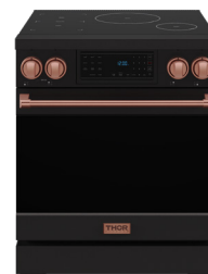
ROSE GOLD RSI30B-RSG