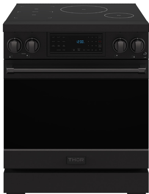
Product: 30 INCH PROFESSIONAL INDUCTION RANGE IN BLACK Model Number: RSI30B