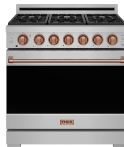
ROSE GOLD RSG36P-RSG