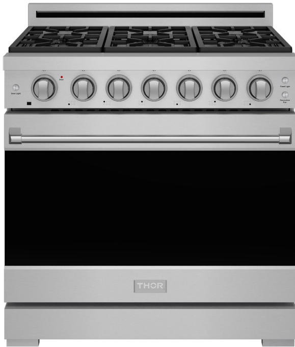
Product: 36 INCH PROFESSIONAL GAS RANGE IN STAINLESS STEEL Model Number: RSG36P