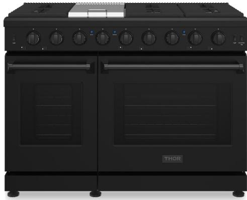
Product: 48 Inch Professional Gas Range in Black Model Number: LRG4807UB / LRG4807UBLP