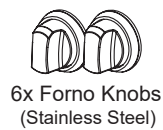
6x Forno Knobs (Stainless Steel)