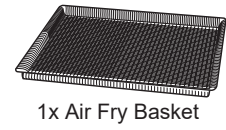
1x Air Fry Basket