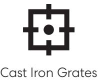
Cast Iron Grates